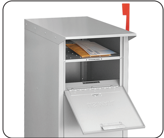
Front view of #4375 displayed