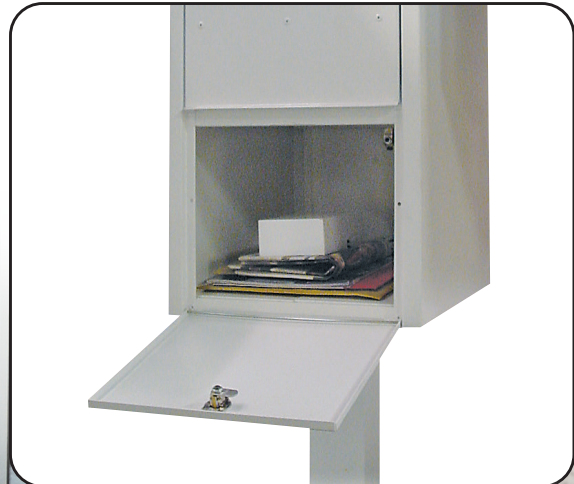
Rear view of #4375 displayed